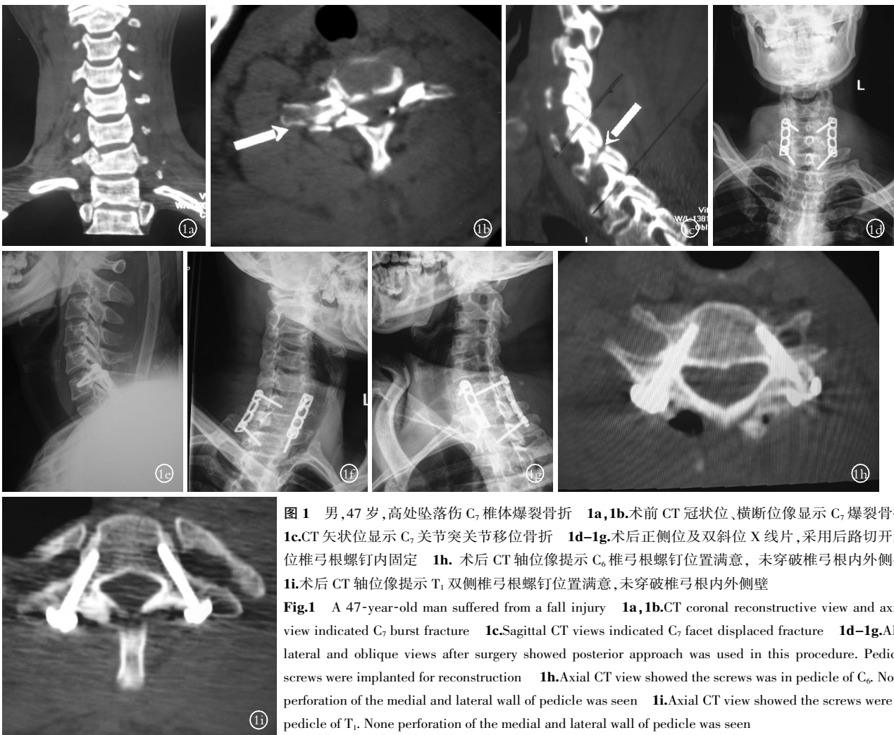
图 1 男,47 岁,高处坠落伤 C 7 椎体爆裂骨折 1a,1b.术前 CT 冠状位、横断位像显示 C 7 爆裂骨折 1c.CT 矢状位显示 C 7 关节突关节移位骨折 1d-1g.术后正侧位及双斜位 X 线片,采用后路切开复位椎弓根螺钉内固定 1h.术后 CT 轴位像提示 C 6 椎弓根螺钉位置满意,未突破椎弓根内外侧壁 1i.术后 CT 轴位像提示 T 1 双侧椎弓根螺钉位置满意,未突破椎弓根内外侧壁

(1)颈椎椎弓根螺钉的植入:充分暴露颈胸段颈椎侧块,取侧块外上象限中点作为进钉点,用球形钻头磨去骨皮质。用丝锥制备钉道,注意向尾侧倾 10°,锥入的深度约 2~2.5 cm(具体的进钉点及方向参考每位患者术前 CT 行个体化处理)。攻丝锥时要注意寻找松质骨的“软区”,若遇到较大阻力,则应改变方向,尽量顺软区前进。丝锥完成后,利用椎弓根探针探测通道的四周及底部,探查时若为骨性、有摩擦感的侧壁及坚实的底部,则通道制备正常,未穿出椎体前缘,根据所需长度可植入直径 3.5 mm 或 4.0 mm 的椎弓根螺钉;若为软区,无阻挡的软性侧壁或底部,则说明已穿出骨皮质外,此时应仔细分析原因并行 C 形臂透视,如二次或多次锥入仍错误,则应咬除同侧椎板,直视下行椎弓根螺钉的植入,本组 3 枚椎弓根螺钉进行了此种操作。当穿刺点有骨折时,应分情况对待: