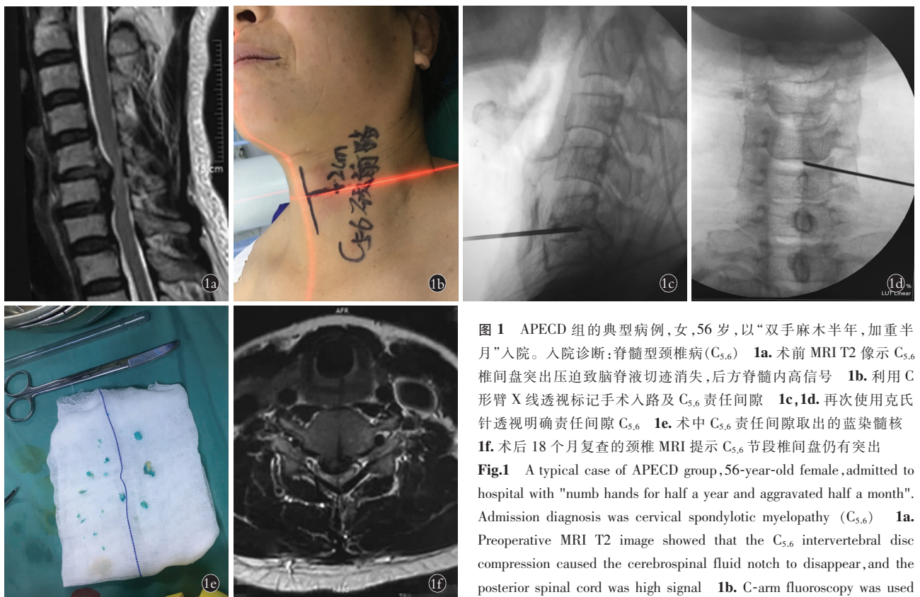
图 1 APECD 组的典型病例, 女, 56 岁, 以“双手麻木半年, 加重半月”入院。入院诊断: 脊髓型颈椎病 (C 5,6 ) 1a. 术前 MRI T2 像示 C 5,6 椎间盘突出压迫致脑脊液切迹消失, 后方脊髓内高信号 1b. 利用 C 形臂 X 线透视标记手术入路及 C 5,6 责任间隙 1c, 1d. 再次使用克氏针透视明确责任间隙 C 5,6 1e. 术中 C 5,6 责任间隙取出的蓝染髓核 1f. 术后 18 个月复查的颈椎 MRI 提示 C 5,6 节段椎间盘仍有突出

采用 SPSS 15.0 软件进行统计学分析。定量资料均以均数 ± 标准差 ( \bar{x} \pm s ) 表示, 采用成组设计资料 t 检验或配对设计资料 t 检验; 计数资料组间比较采