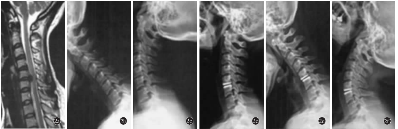
图 2 CDR 组典型病例,女,56 岁,以“双上肢麻木 3 个月,加重半月”入院。入院诊断:脊髓型颈椎病(C 5,6 ) 2a,2b,2c . 术前 MRI 及过伸过屈位 X 线片示无失稳 2d,2e,2f . 术后 18 个月侧位及过伸过屈位 X 线片可见假体位置良好,颈椎活动度良好,较术前明显改善,未出现异位骨化 Fig.2 A typical case of CDR group,56-year-old female,admitted to hospital with "numb upper limbs numbness for three months,aggravated by half a month". Admission diagnosis was cervical spondylotic myelopathy (C 5,6 ) 2a,2b,2c . Preoperative MRI and X-rays of hyperextension and hyperflexion showed no instability 2d,2e,2f . At 18 months after operation,X-rays of lateral position and hyperextension and hyperflexion showed that the prosthesis was on good position and the cervical spine mobility was good,which was significantly improved compared with preoperatively,without heterotopic ossification