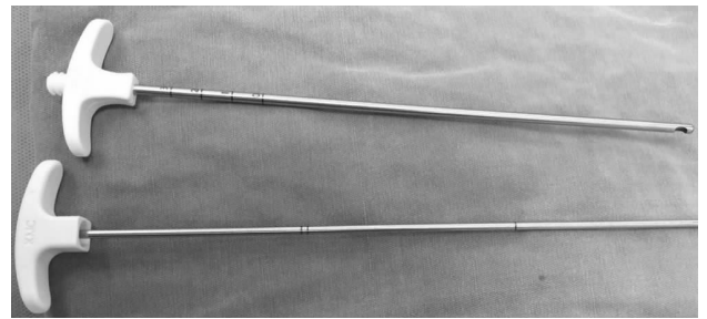
图 1 定向骨水泥导向器:远端封闭,开口位于侧方,通过旋转可控制骨水泥推注方向

观察组:采用单侧椎弓根入路,进针点位于椎弓根外上方(左侧为 10 点钟位置,右侧 2 点钟位置),当针尖在正位片上位于椎弓根内侧缘,侧位片超过椎体后缘时,退出穿刺针建立工作通道,球囊扩张,调制骨水泥,待骨水泥处于拉丝期晚期或团状期早期时推注骨水泥。采用定向骨水泥导向器(图 1),先将开口对准塌陷的终板下方灌注,C 形臂 X 线透视监测骨水泥量及弥散,随时旋转导向器调整弥散方向( 360^\circ ),待骨水泥凝固后拔出工作套管。