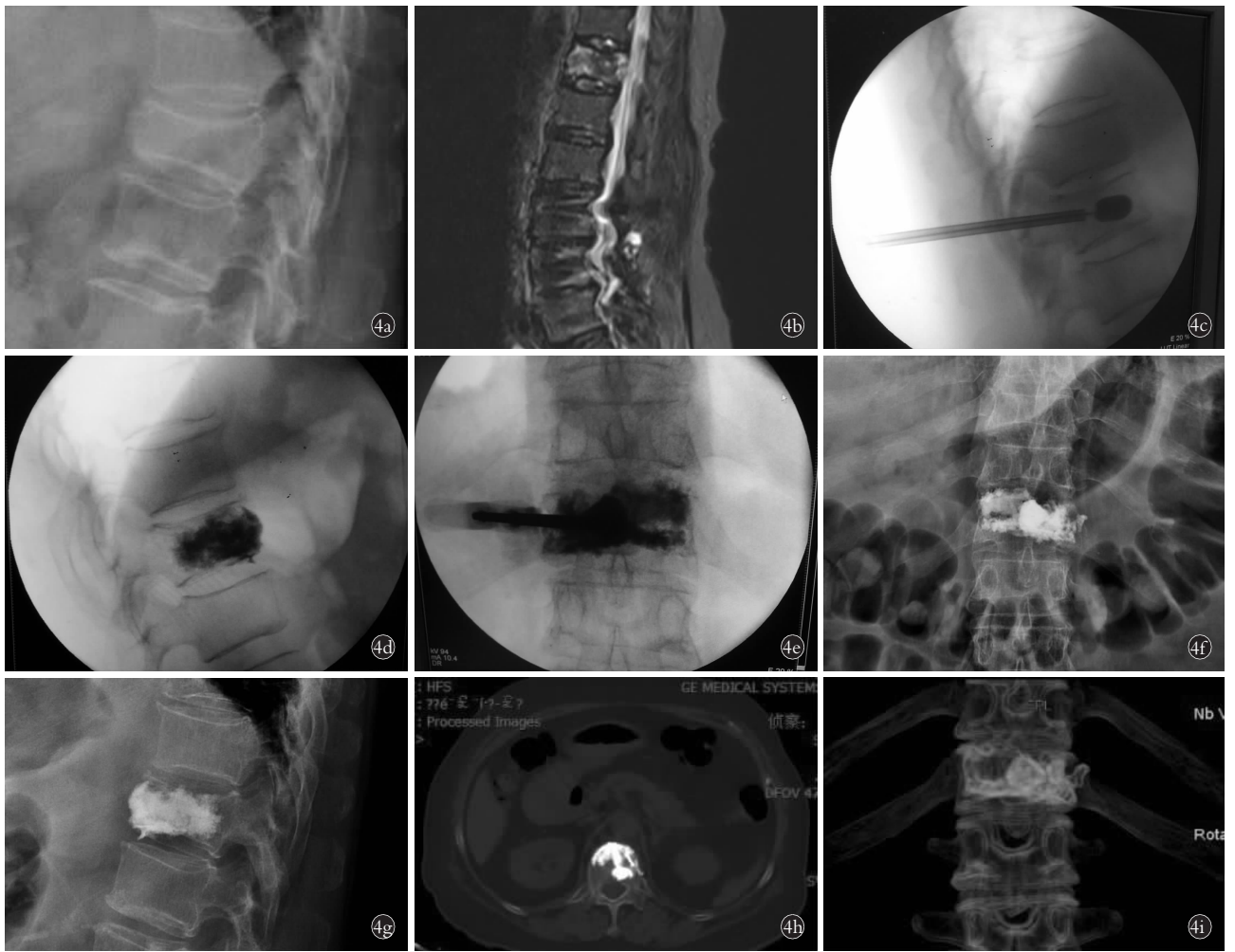
图 4 患者,女,71 岁,T 12 椎体压缩骨折,应用定向骨水泥导向器行 T 12 椎体单侧 PKP 4a 。术前 X 线侧位片显示 T 12 椎体压缩骨折 4b 。MRI 矢状位 T2 加权图像,椎体内表现为高信号 4c,4d,4e 。术中 C 形臂 X 线透视球囊扩张及骨水泥弥散情况 4f,4g 。术后 1 d 腰椎正侧位 X 线片显示 T 12 椎体骨水泥充填满意 4h,4i,4j 。术后 1 d T 12 椎体三维 CT,显示骨水泥在椎体内分布满意