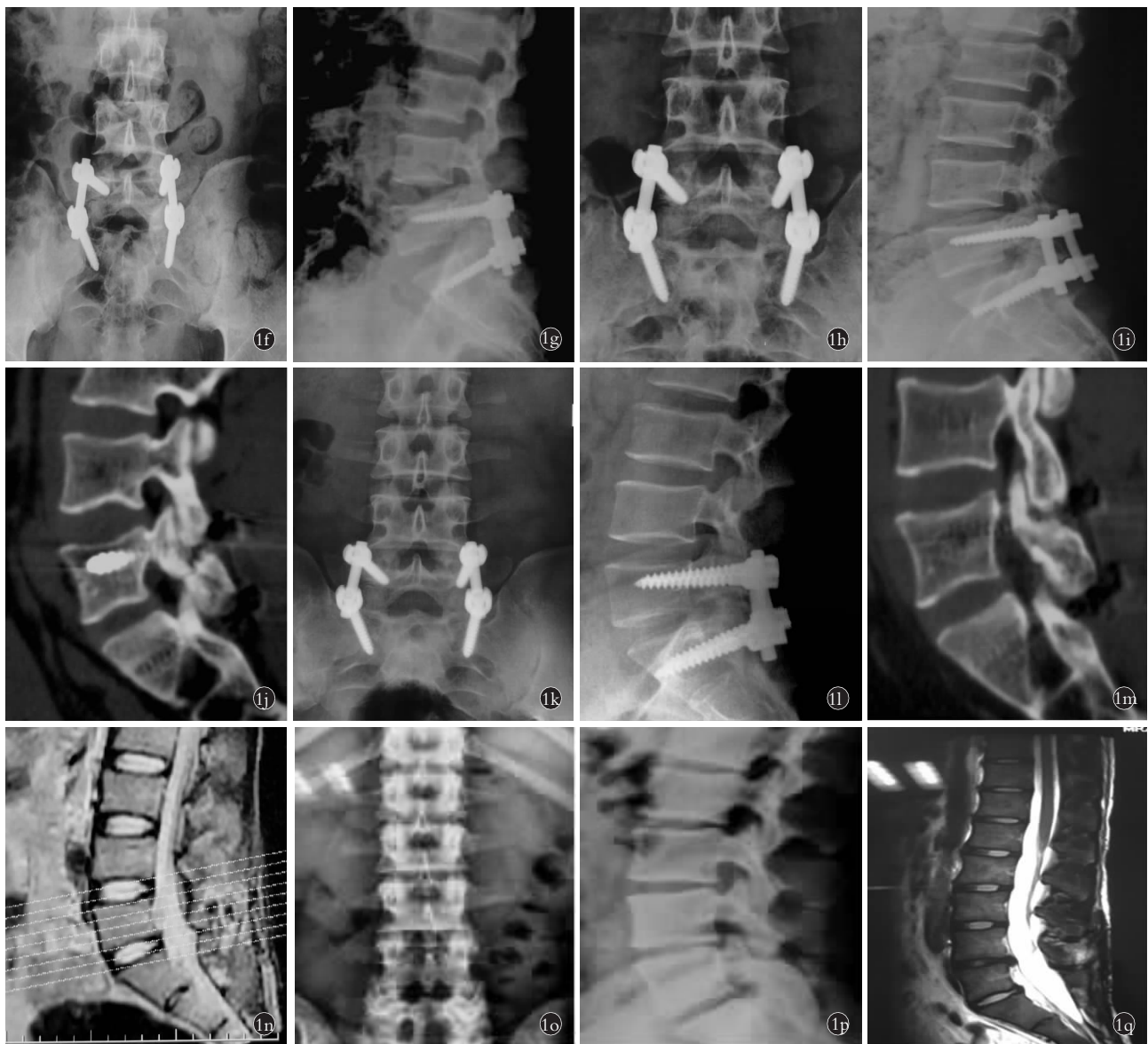
图 1 患者,男,18 岁,L 5 峡部裂,腰椎无滑脱 1f. 术后 1 周正位 X 线片见内固定在位良好 1g. 术后 1 周侧位 X 线片见内固定在位良好 1h. 术后 6 个月正位 X 线片见内固定在位良好,螺钉无松动 1i. 术后 6 个月侧位 X 线片见内固定在位良好,螺钉无松动 1j. 术后 6 个月腰椎 CT 重建见峡部未完全融合 1k. 术后 12 个月腰椎正位 X 线片见内固定在位良好,螺钉无松动 1l. 术后 12 个月腰椎侧位 X 线片见内固定在位良好,螺钉无松动 1m. 术后 12 个月腰椎 CT 重建见峡部完全融合 1n. 术后 12 个月腰椎 MRI 无病变节段及相邻节段退变 1o. 术后 8 年,内固定已去除,腰椎稳定,序列正常 1p. 术后 8 年,内固定已去除,序列正常,无退变及峡部再发骨折 1q. 术后 8 年,腰椎 MRI 见 L 5 S 1 间盘信号正常