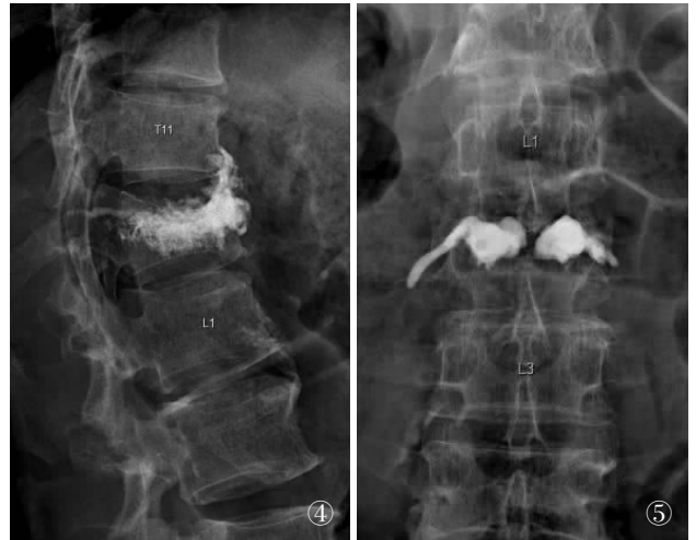
图 4 患者, 男, 66 岁, PVP 术后骨水泥向椎体前缘渗漏 图 5 患者, 女, 71 岁, PVP 术后骨水泥向静脉渗漏

相关报道不多。Salvatore 等 [14] 根据矢状面骨折线的位置进行分组研究发现, 骨水泥在骨折区域分布情况与临床疗效关系密切。然而, 由于骨折区域属于一种三维结构, 因此单纯依靠矢状面或者横断面去界定, 并不严谨, 特别是对于单侧椎体的骨折, 如果骨水泥推注到另一侧, 术后 X 线片由于叠加作用, 可显示骨折区骨水泥分布良好, 但临床效果却并不满意。本研究借助三维影像技术, 同时结合计算机辅助软件, 于术前通过 MRI 抑脂像确定骨折的区域, 并