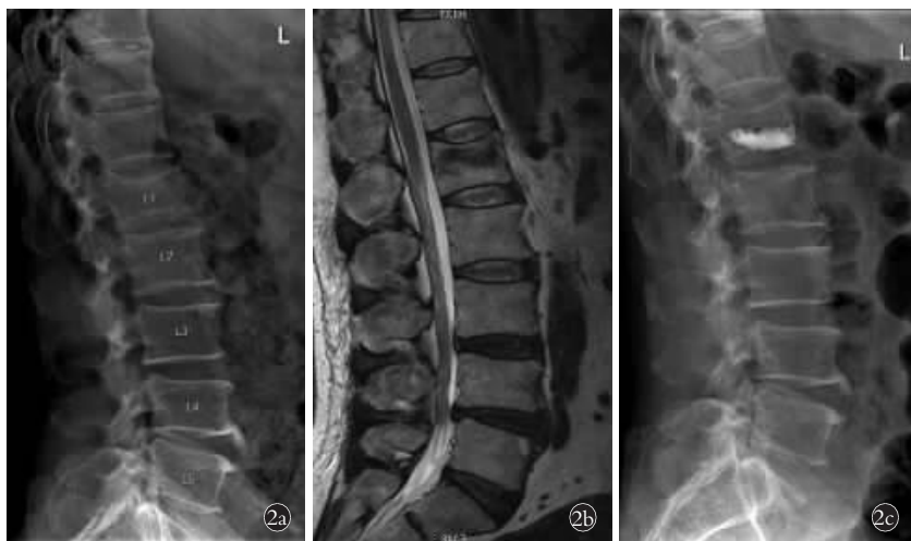
图 2 患者,男,66 岁,跌倒致腰部疼痛 2 d 住院 2a. 术前侧位 X 线示 L 1 椎体压缩性骨折 2b. 术前 MRI 示骨折线位于椎体中上部 2c. 术后 X 线显示骨水泥位置偏下,通过计算发现骨水泥在骨折线区域分布范围<50%,纳入对照组

Fig.2 A 66-year-old male patient who has lumbar pain for 2 days because of falling was admitted to hospital 2a. Preoperative lateral X-ray showed L 1 vertebral compression fracture 2b. Preoperative MRI showed the fracture line was located on the upper middle part of the vertebral body 2c. Postoperative X-ray showed the position of the cement was lower and through calculation the distribution of bone cement on the fracture line area was found to be less than 50%, and included in control group