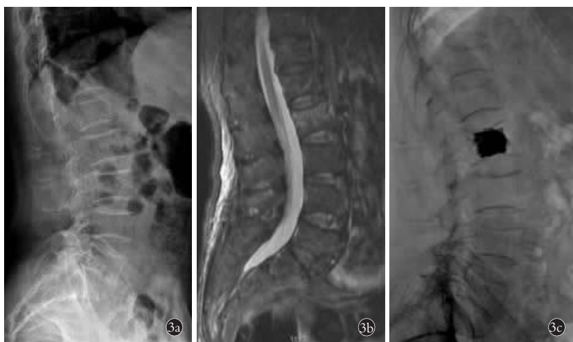
图 3 患者,男,67 岁,因腰痛 10 d 入院 3a. 术前 X 线检查提示 L 2 椎体压缩性骨折 3b. 术前 MRI 提示骨折线位于椎体中上部 3c. 术后 X 线显示骨水泥充满整个椎体。通过计算发现骨水泥在骨折线区域分布范围>50%,纳入观察组

Fig.2 A 66-year-old male patient who has lumbar pain for 2 days because of falling was admitted to hospital 2a. Preoperative lateral X-ray showed L 1 vertebral compression fracture 2b. Preoperative MRI showed the fracture line was located on the upper middle part of the vertebral body 2c. Postoperative X-ray showed the position of the cement was lower and through calculation the distribution of bone cement on the fracture line area was found to be less than 50%, and included in control group